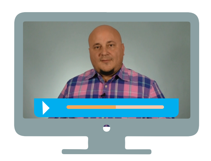
"Moving Listening to the Next Level in Your Marketing"

Finally, take a deep look at what your top two or three competitors are doing in social. Look closely at the full conversations behind their tweets originating from their main account. Do their customers consistently complain about pricing or uptime? Or are there multiple customer conversations praising their support and product teams? Understanding the general social sentiment toward them is interesting data to have.