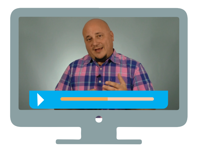
"Tips for Improving Your Marketing Automation Efforts"

As part of this process, think deeply about the automated program logic within your programs, including the possibility of connecting across channels