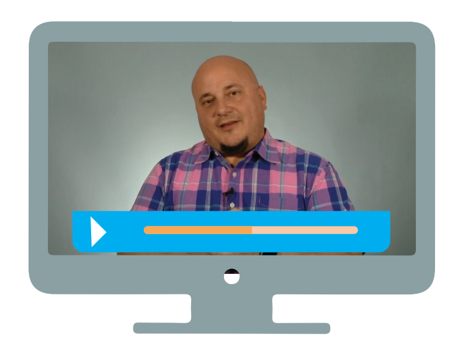
"How Segmentation Helps Marketers Decide What to Focus On"

Once your model is in place, you can then use scoring to segment an entire group (send offer A to everyone with this score) or trigger one-to-one communications (send this offer when an individual crosses this scoring threshold).