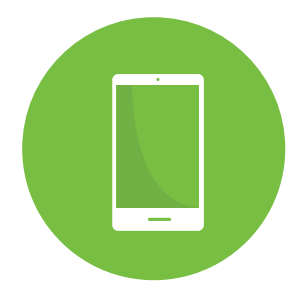
The Demand for Cutting-edge Technology