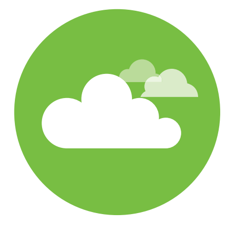
Integrated and intuitive technologies