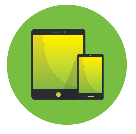
Mobile collaboration tools and apps