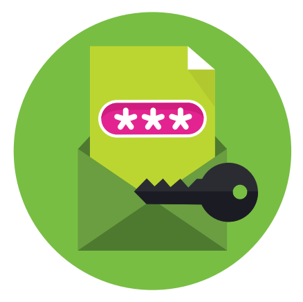
Strong and simple security, like email encryption and e-signatures