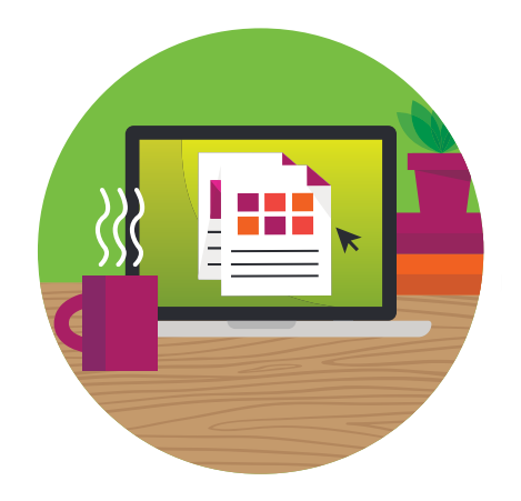
Remote access to business files

If you want them on your team, serve up a powerful set of tools that empowers them be productive from any device, anywhere, any time.