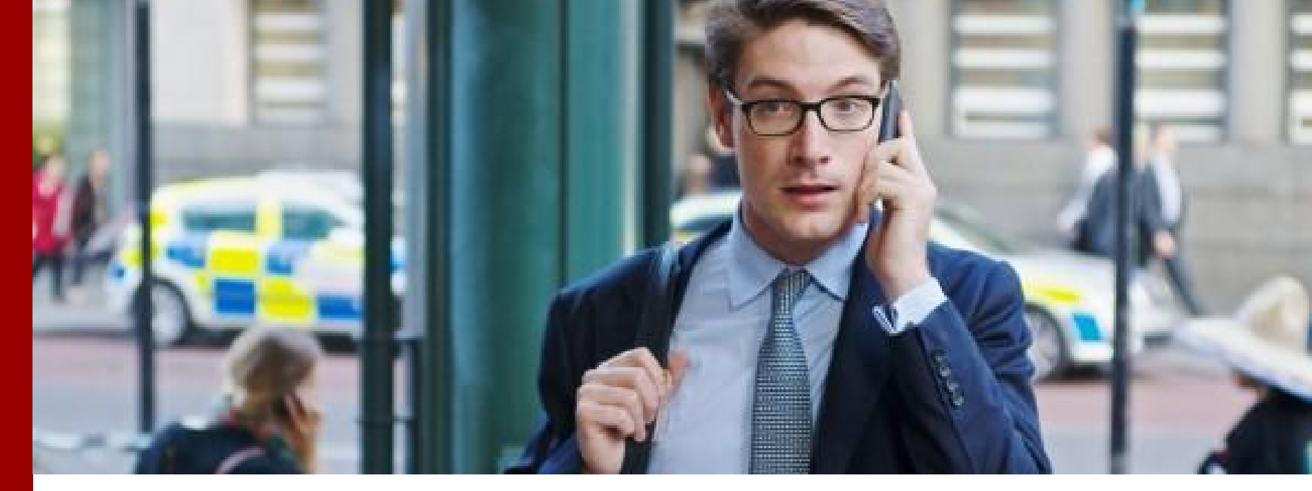
Initial learning efforts should be externally directed.

Installing a structured approach that is executed by a qualified third party will move the process forward faster and more efficiently. In addition, delegating this task to an outside entity strengthens the commitment to getting it done. It's also likely that an outside entity will be far better equipped to give the learners better and deeper instruction than they could develop on their own. "Self-taught" is not always necessarily better--this is one of those times!