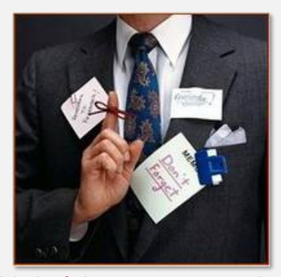
A lack of planning on your part does not constitute an emergency on my part Sign in client office

And remember to always... Clear Your Desk. Clear Your Mind. Organize it.®